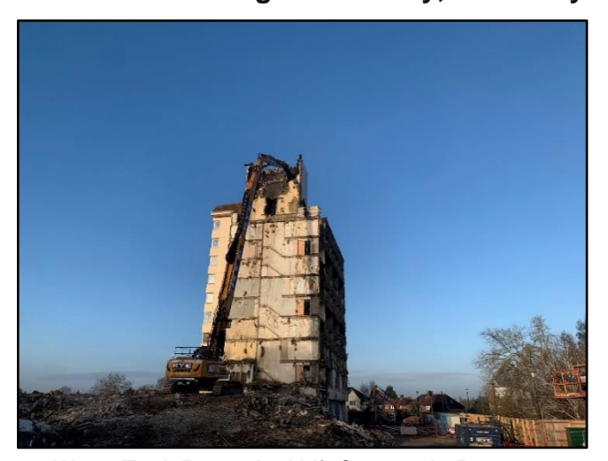
Water Tank Room And Lift Overrun In Progress

We will be closing the site for the holiday period from the end of Thursday, 22 December 2022 and returning on Tuesday, 3 January 2022.