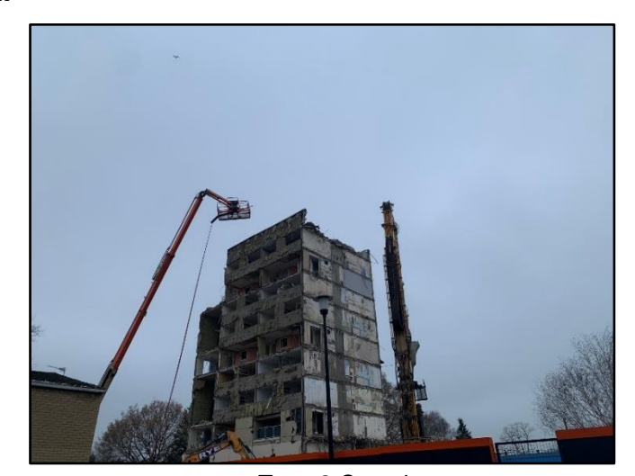
Zone 8 Complete