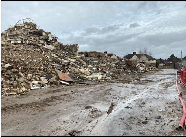
Waste material stockpiled