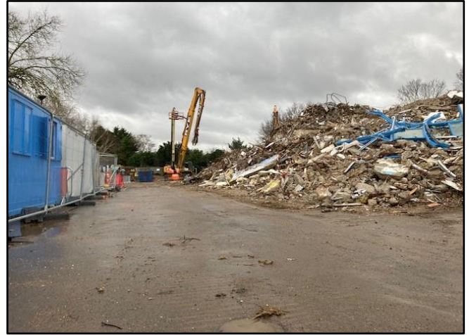
Internal site access road