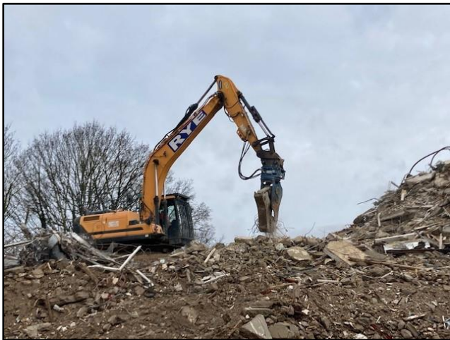
Excavator at work separating materials