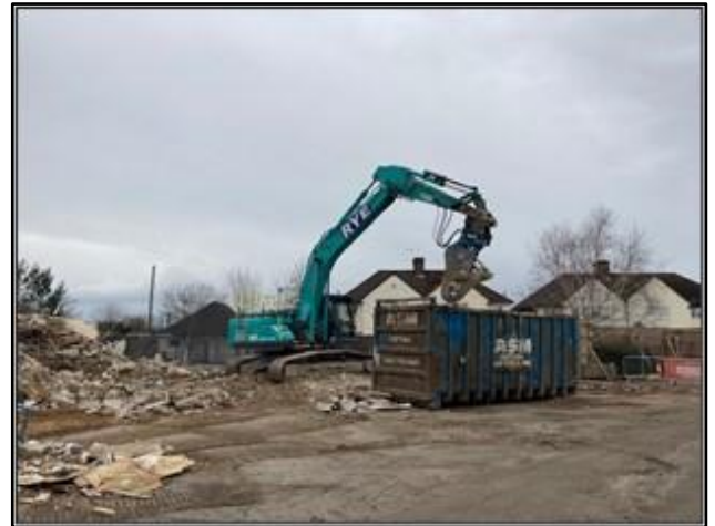
Excavator sorting steel to skips