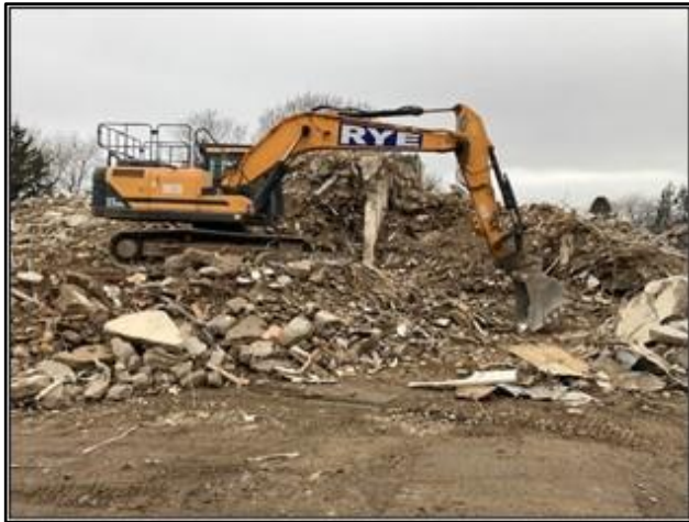
Excavator sorting materials