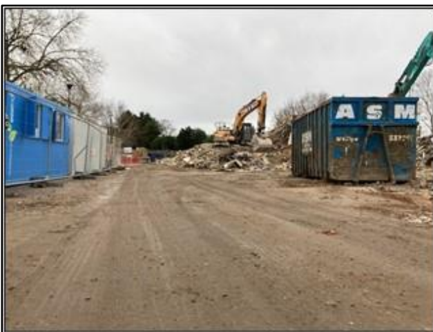
Access road through the site