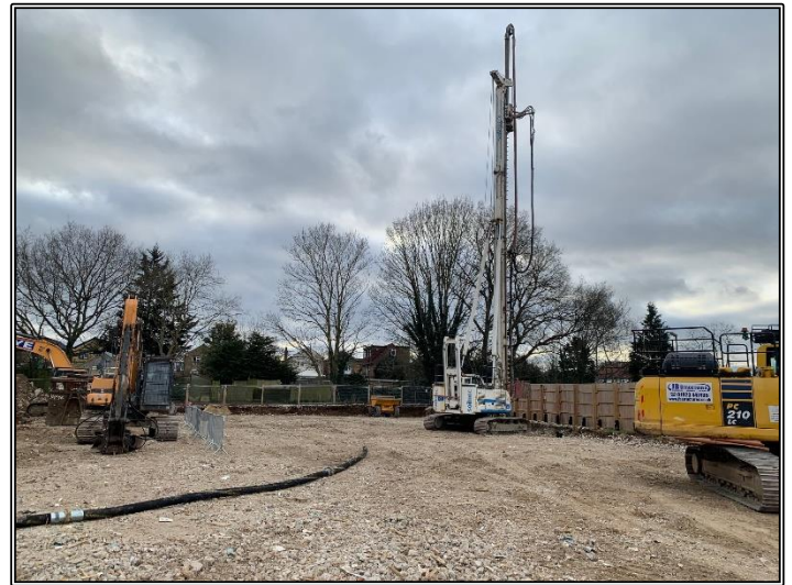
Piling Rig on Site