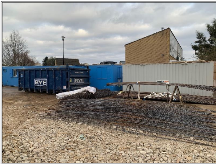
Steel Cages for Piles