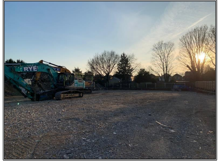
Section of Completed Piling Mat