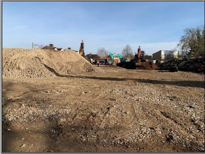
Piling Mat Works in Progress