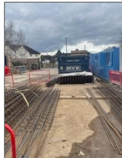
Rebar storage area