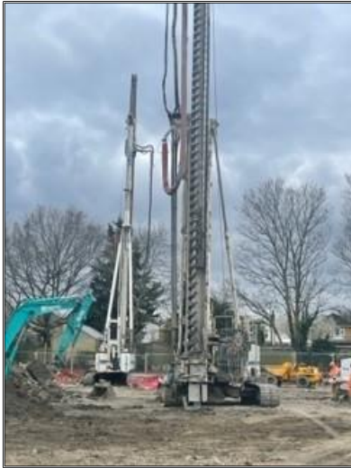
Pilling works in progress