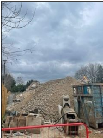
Crushed concrete ready for recycling