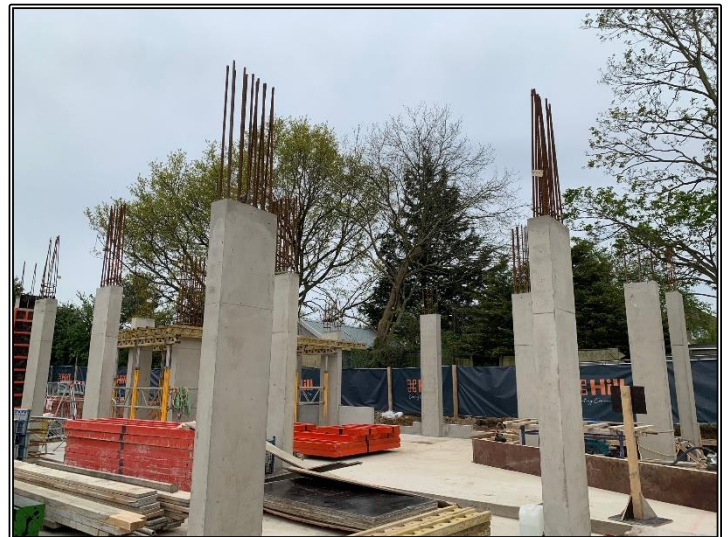
Ground to First Floor Columns