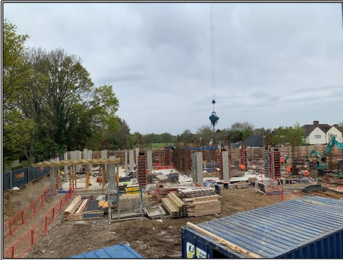
Core A - Overview