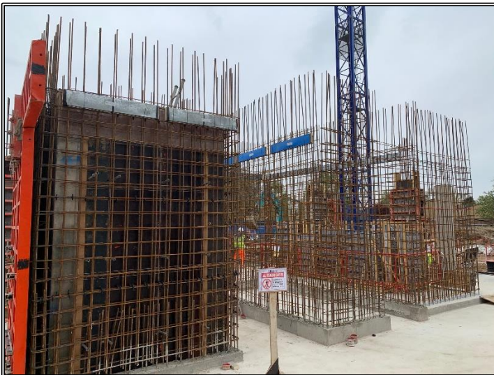
Lift Shaft and Stair Core