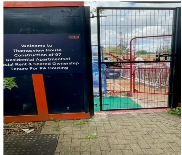
New site signage