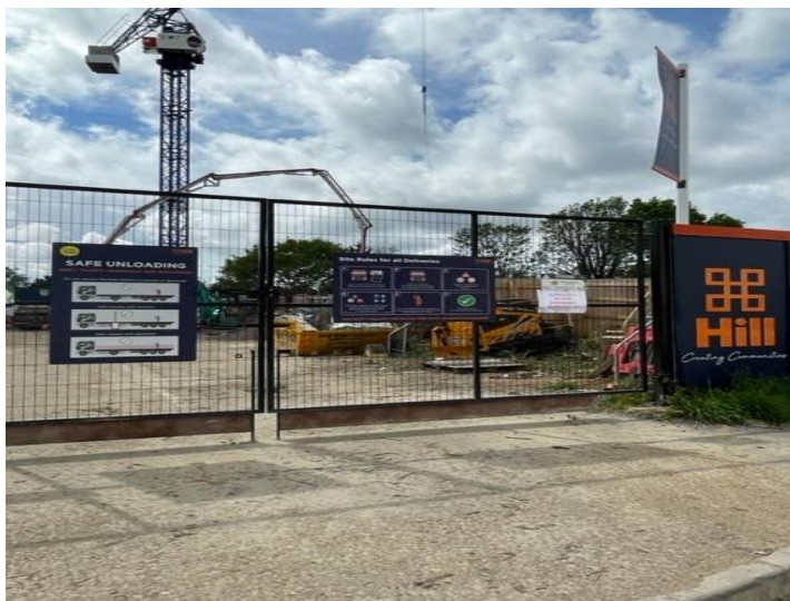
New site signage