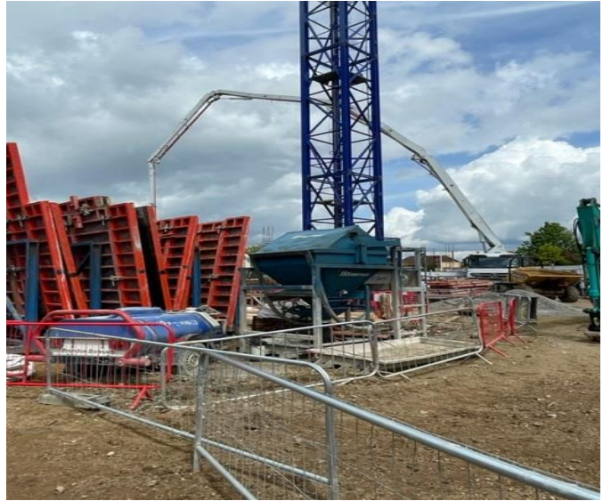
Ground floor slab pour