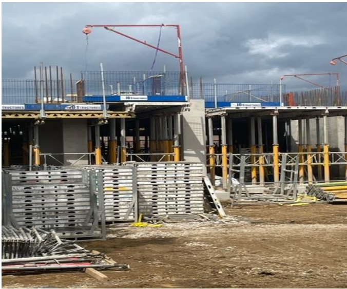
First floor slab preparation