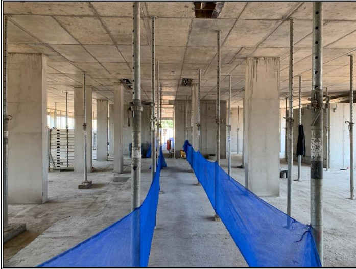
First Floor Striking Complete