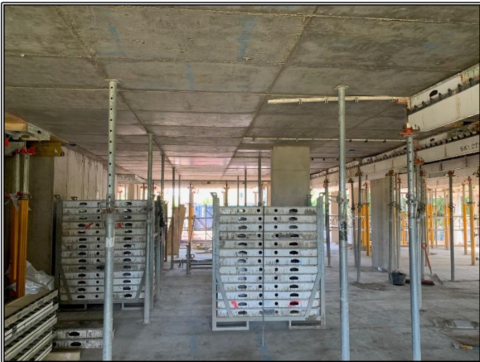
Second Floor Striking in Progress