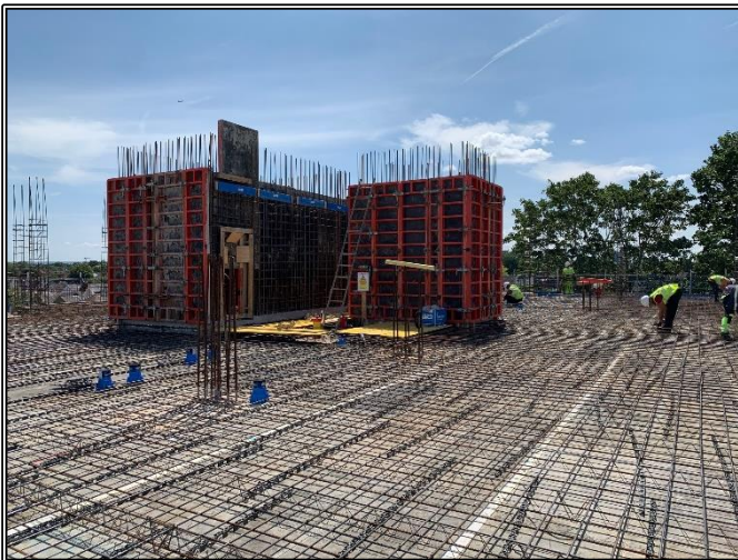
Fourth Floor Slab Reinforcement