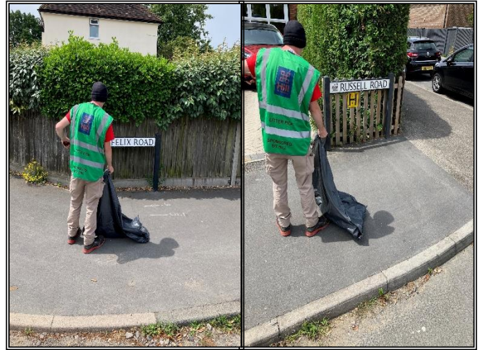
Litter Pick Around Neighbouring Streets