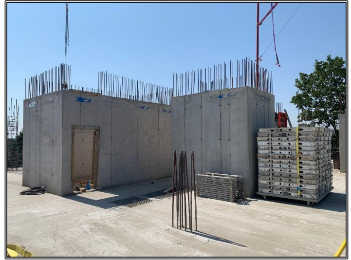
Third Floor Core A Walls