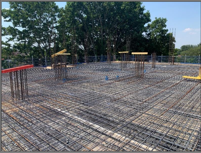
Third Floor Core A Slab Reinforcement