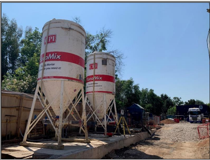
Mortar Silos for Brickwork Delivered