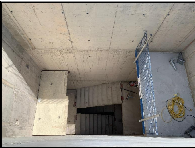
Precast Stair Install