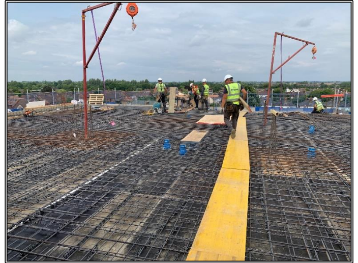
Level 4 Core B Slab Reinforcement