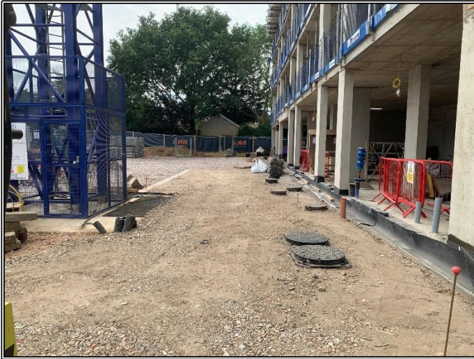
External Areas Ready for Tarmac