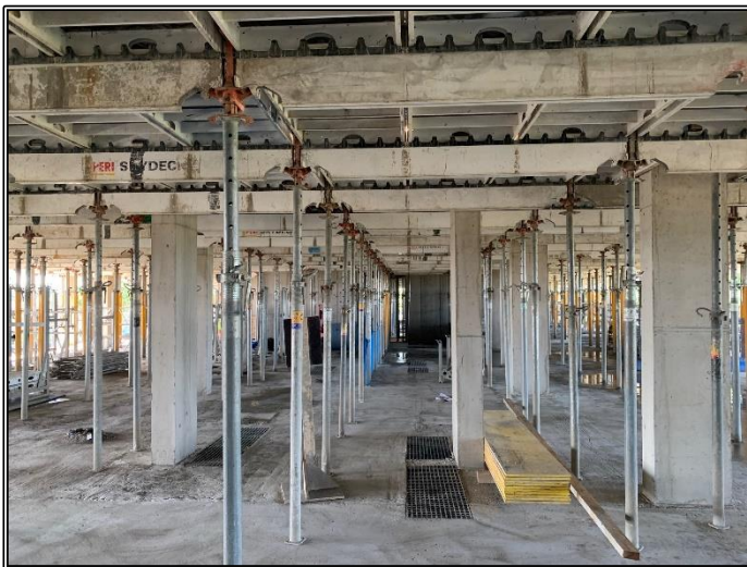
Fourth Floor Slab