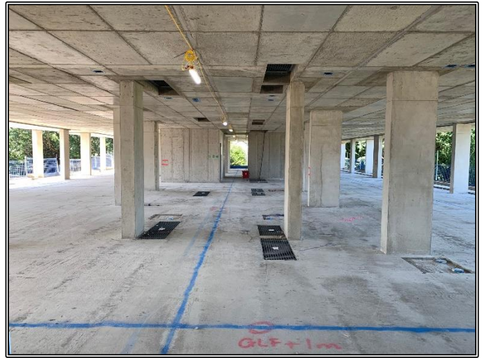
First Floor Back Propping Removed