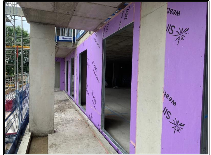
External Wall Board