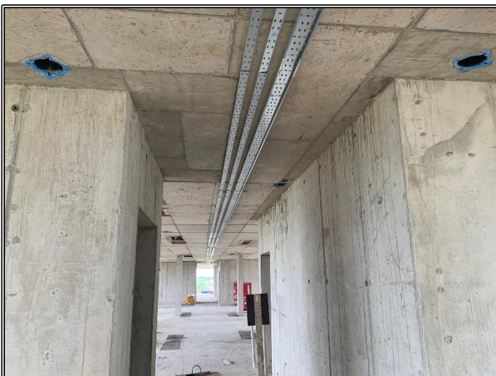
Fourth Floor Containment