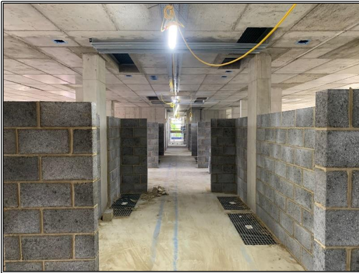
First Floor Blockwork