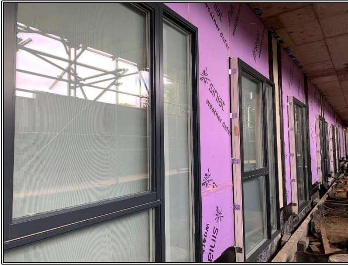
Ground Floor Windows