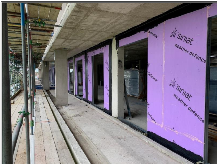
First Floor SFS