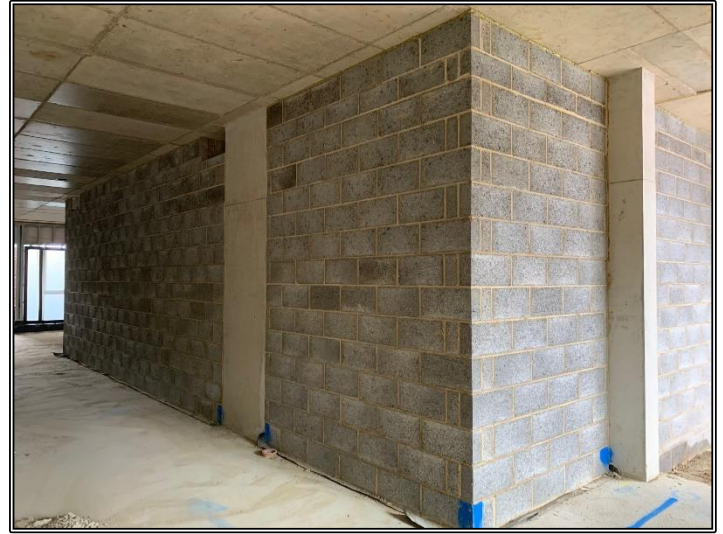
Ground Floor Blockwork