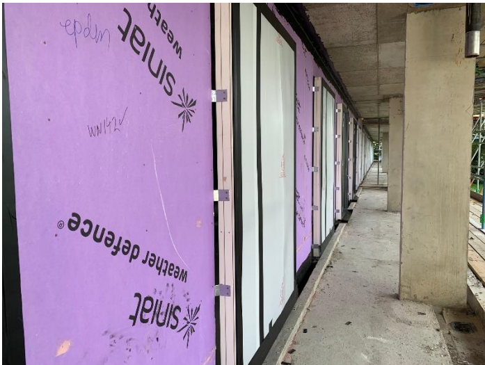
Window Install to the First Floor