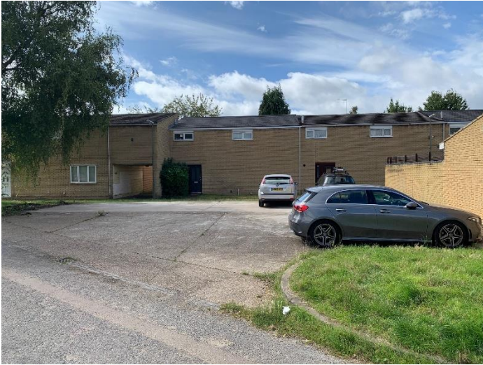
Garage Demolition Complete