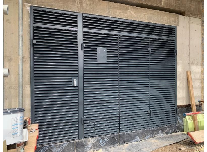
Substation Door Installed