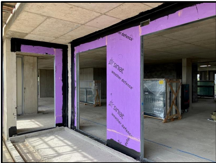
4 th Floor Steel Frame