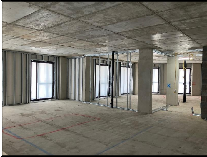
1 st Floor Drylining Commenced