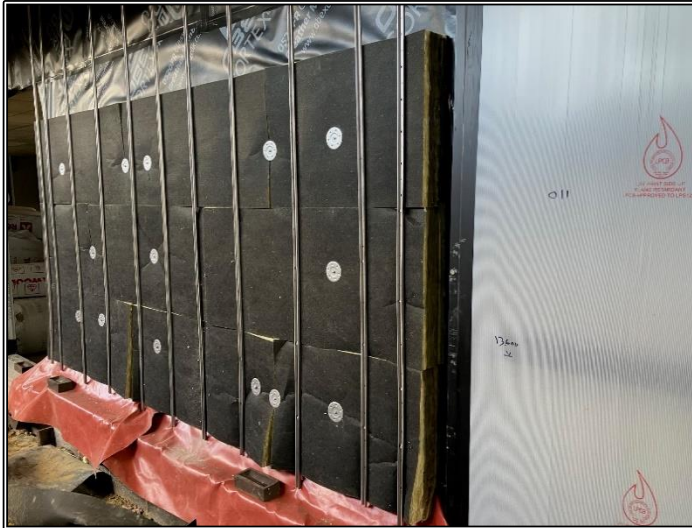
Ground Floor Brickwork

The hot food van will be positioned from 7:30am- 12:00pm at the main site entrance to the Thamesview project.