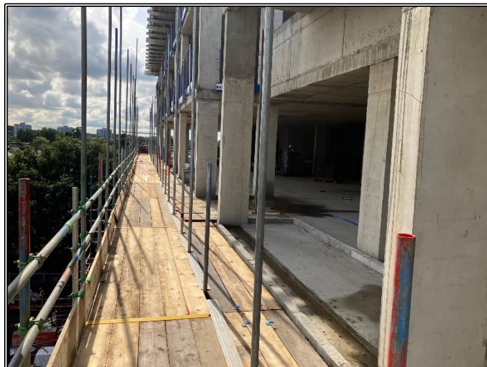
Fifth Floor Scaffolding