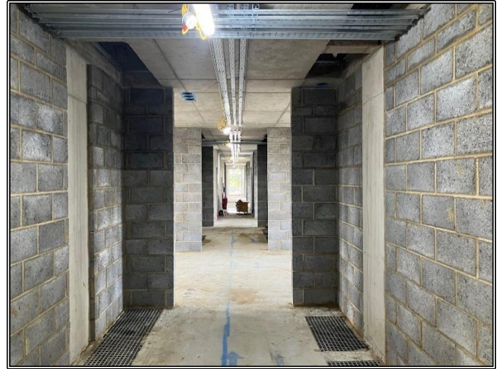
Fourth Floor Blockwork