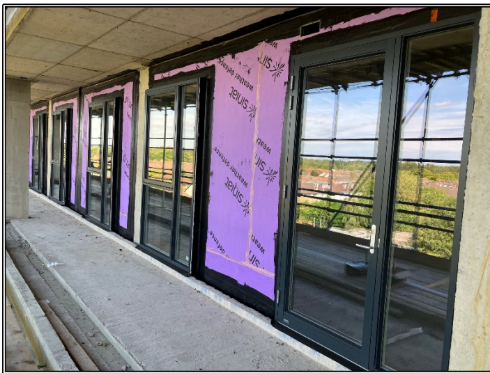
4 th Floor Window Installation