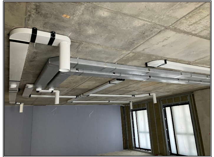
1 st Floor Drylining