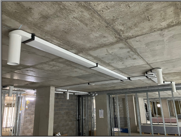
1 st Floor Ventilation Installation