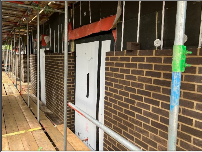
Ground Floor Brickwork

Date: Wednesday 27 th September Time: 4pm- 6pm Location: Site office