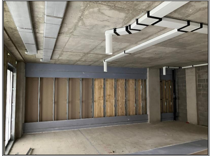
1 st Floor Party Walls