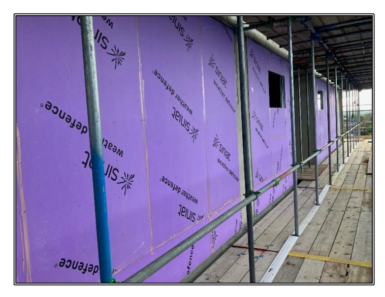
6th Floor Boarding