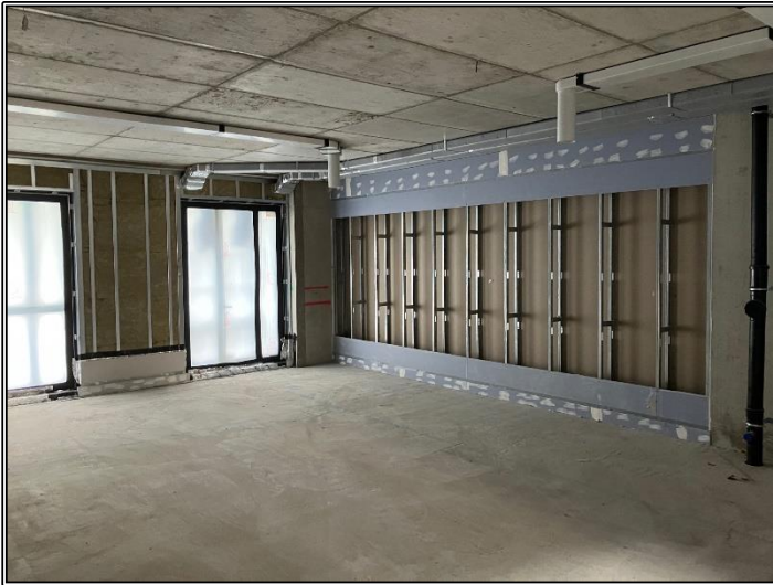
2 nd Floor Drylining