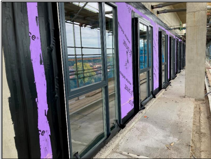
5 th Floor Window Installation