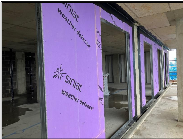
7 th Floor Steel Frame