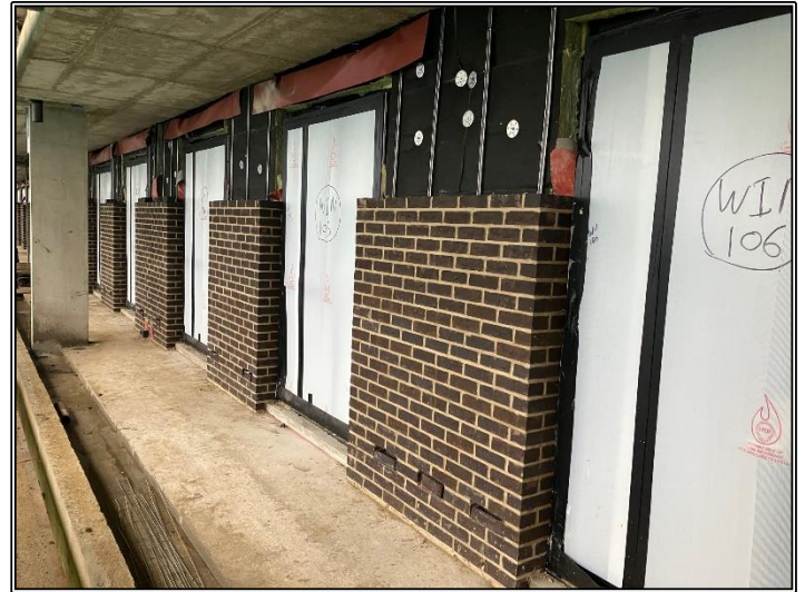
1 st Floor Brickwork