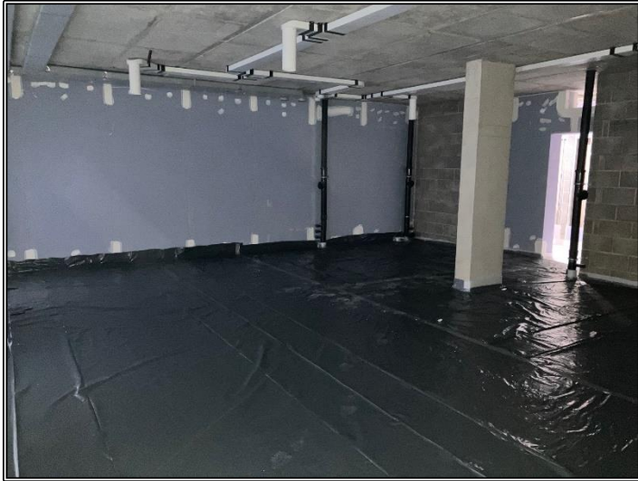
2 nd Floor Screed Insulation