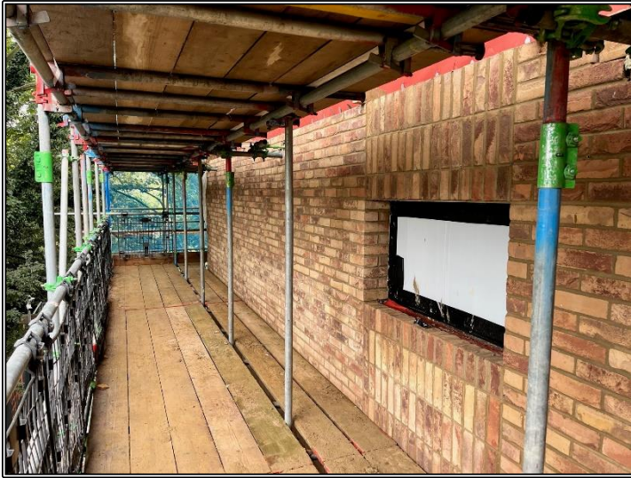
1 st Floor Brickwork