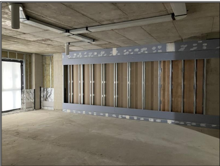
3 rd Floor Party Walls