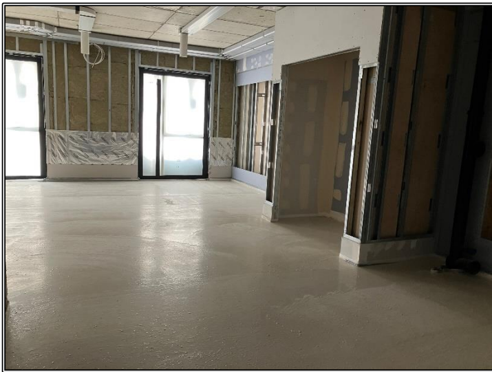
3 rd Floor Screed Installation