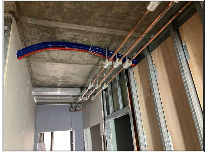
1 st Floor Mechanical First Fix