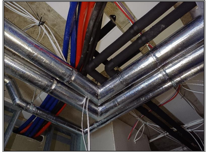
1 st Floor Mechanical First Fix