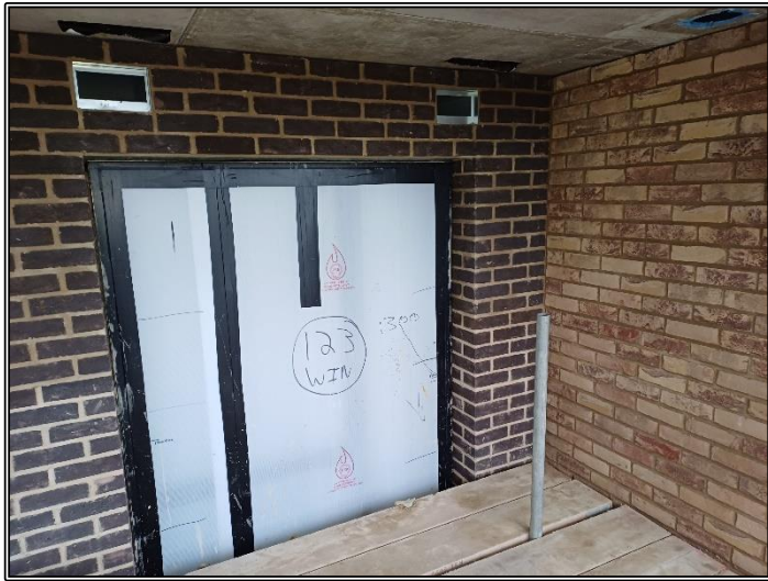
1 st Floor Southeast Brickwork

Please note we have contacted all our contractors and made it very clear that this is to be followed, the site team will continue to monitor this closely. In some instances, awkward car parking can implicate management of this plan. If there are any further concerns, please contact the Social Value and Community Team using the contact details below.