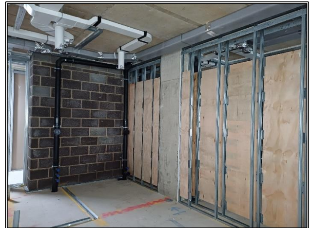
7 th Floor Party Walls