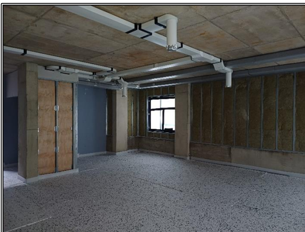
6 th Floor Screed Insulation