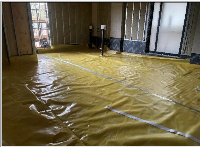
GF Screed Preparation