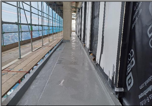
7 th Floor Balcony Waterproofing