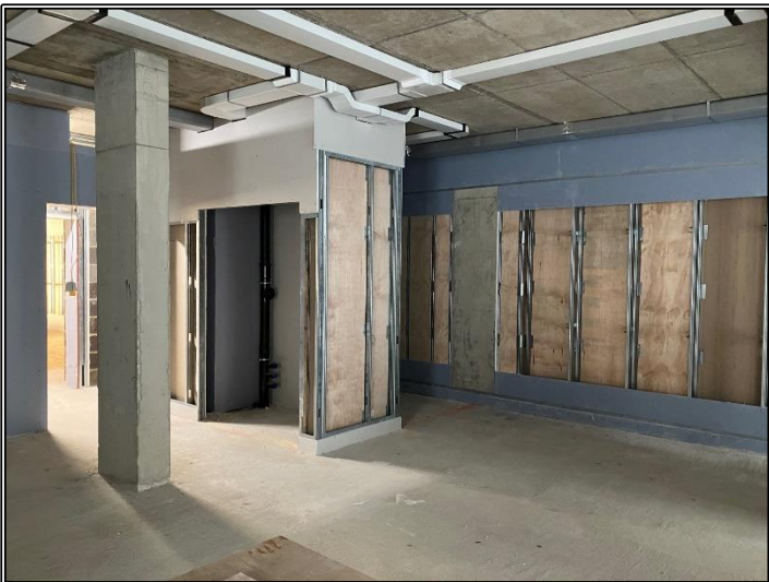
7 th Floor Party Walls