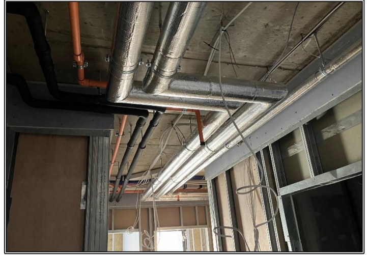
2 nd Floor M&E First Fix