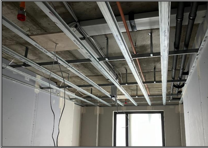
1 st Floor Ceilings Set Out