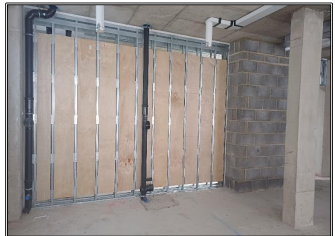
8 th Floor Party Walls