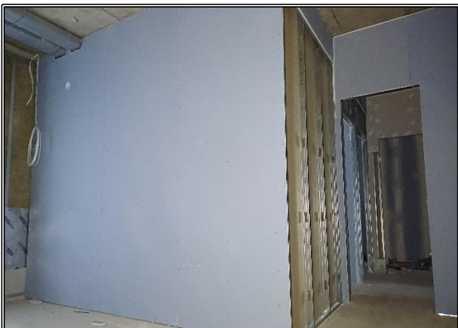
5 th Floor Drylining First Fix