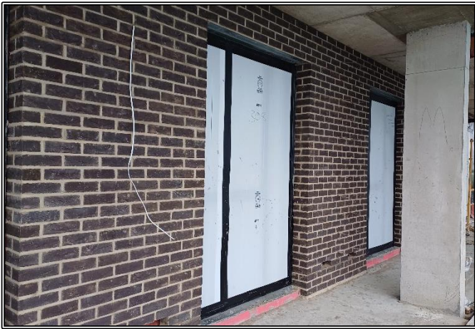
3 rd Floor North-West Brickwork