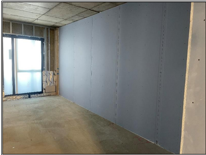
8 th Floor Party Walls