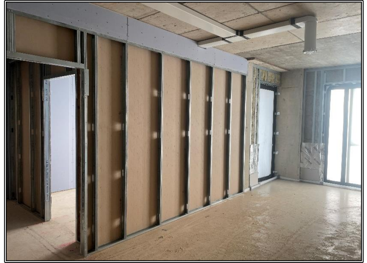
6 th Floor Drylining First Fix