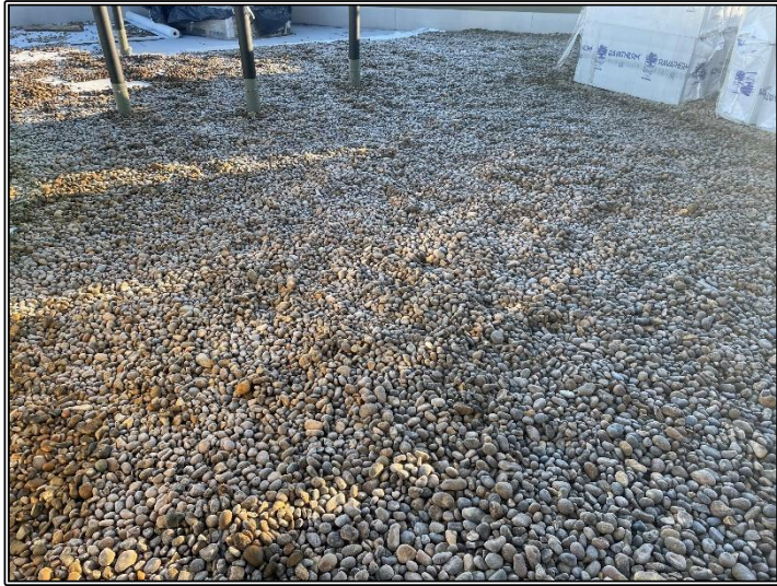
6 th Floor Roof Insulation