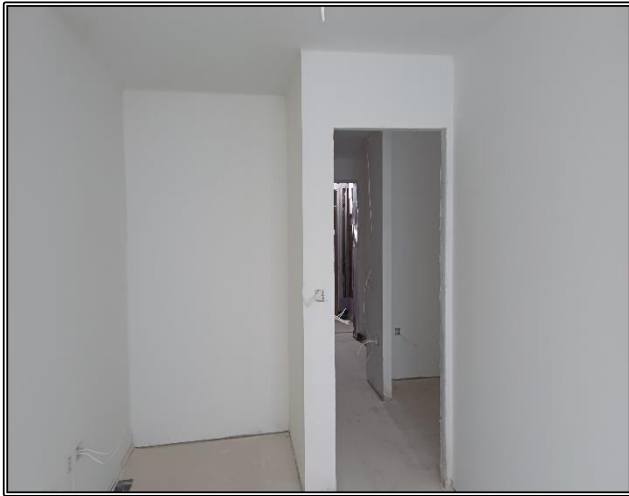
2 nd Floor Mist Coats