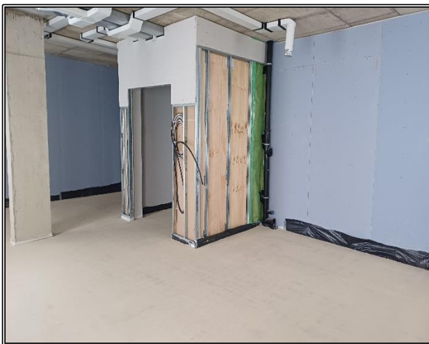
8 th Floor Drylining First Fix