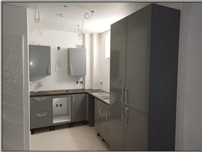
1 st Floor Kitchens