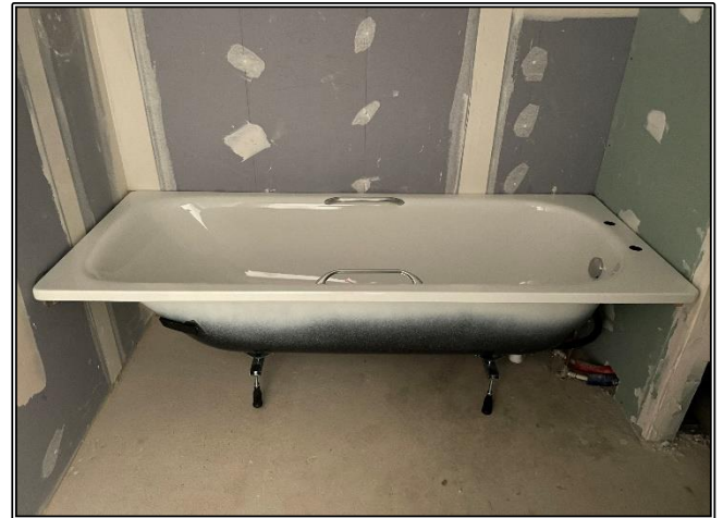
1 st Floor Baths