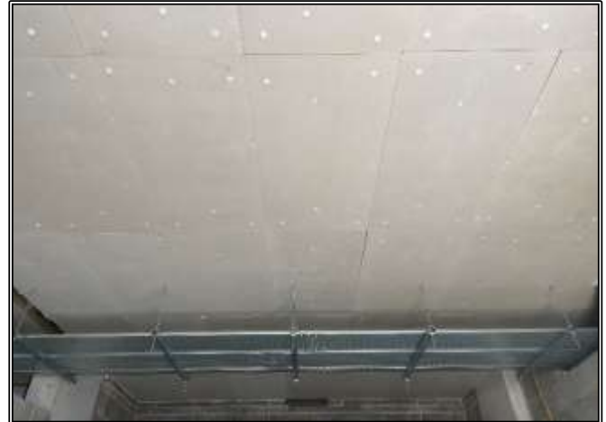
GF Soffit Insulation Complete