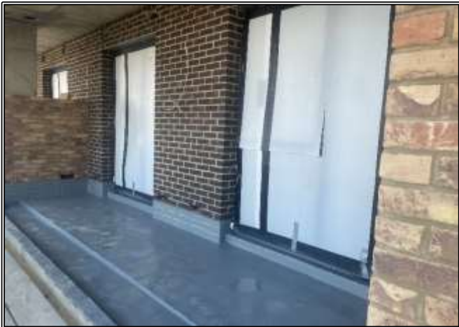
5 TH Floor Balconies Waterproofed