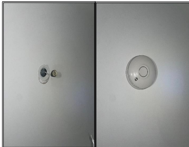
1 st Floor Electrical 2 nd Fix