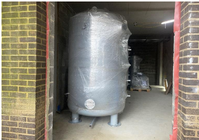
Buffer Vessels On Site