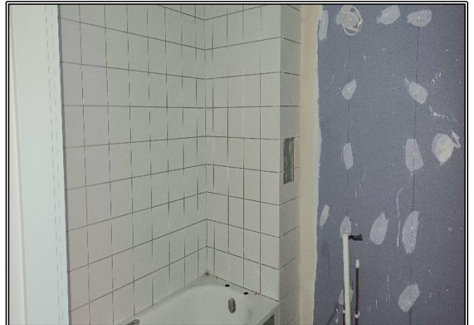
3 rd Floor Bathroom Tiling