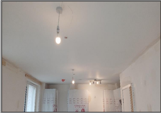
1 st Floor Show Plot Lighting Turned On