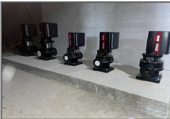
GF Plant Room Hot Water Boosters