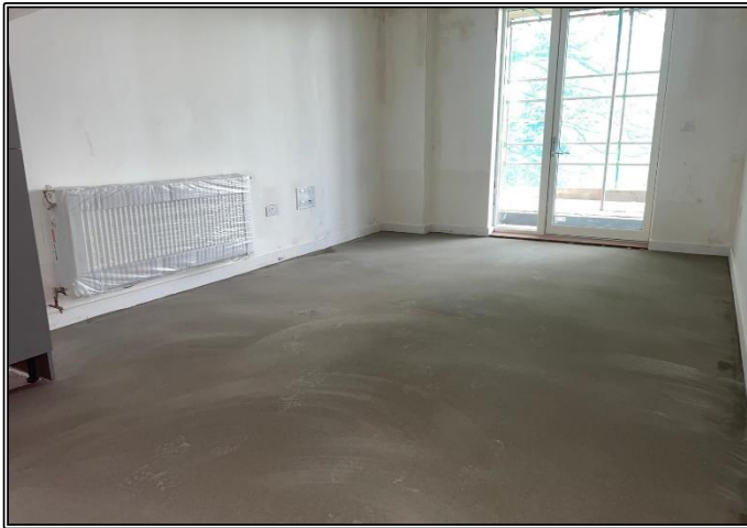
1 st Floor Benchmark Plot Latex