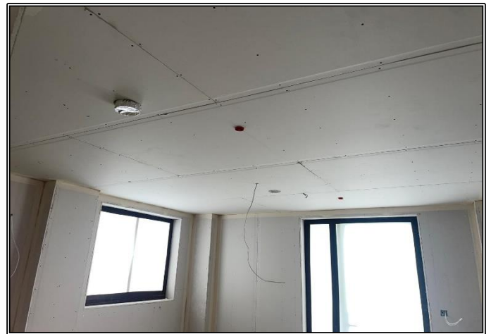
8 th Floor Ceiling Close-Up