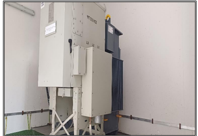
Substation On Site