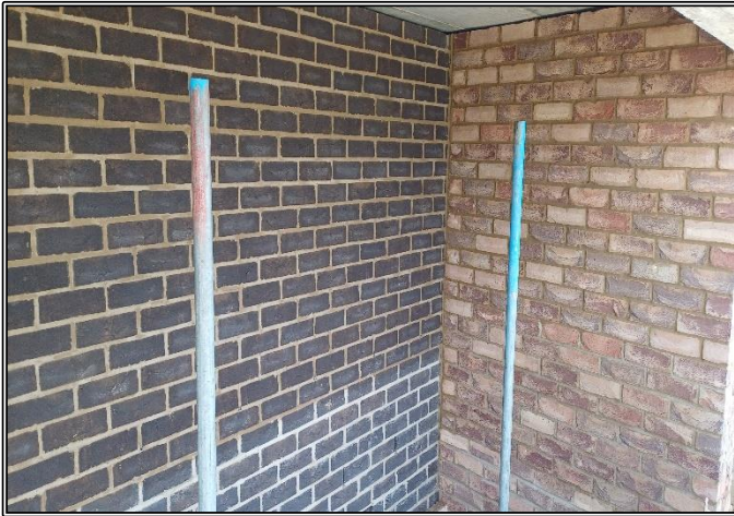
7 th Floor North-West Brickwork Complete