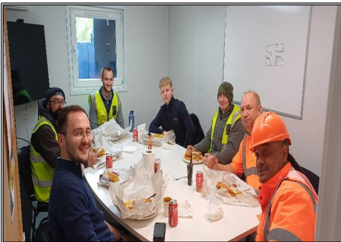
Site Team Lunch In Celebration Of St George's Day